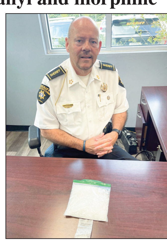
cated methamphetamine laced with fentanyl and morphine.