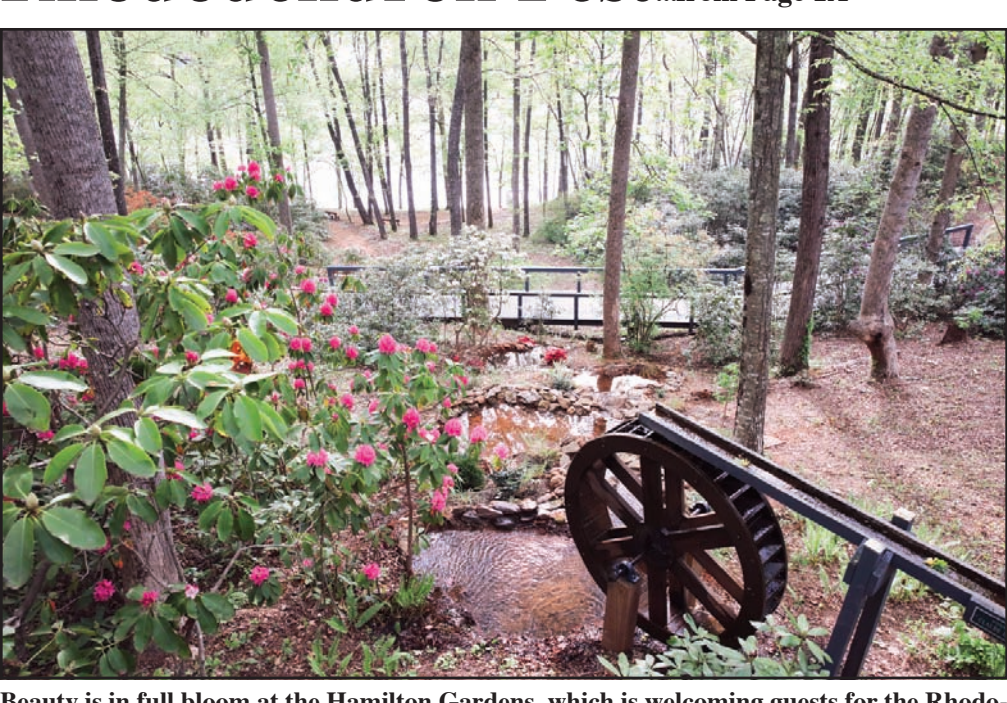
Beauty is in full bloom at the Hamilton Gardens, which is welcoming guests for the Rhodo- dendron Festival over the next three weekends.

that is solely a rhododendron garden in the Southeast that's a public garden.