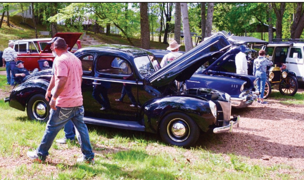
The Memory Lane Classic Car Show was a huge hit inside the Georgia Mountain Fairgrounds over the weekend.